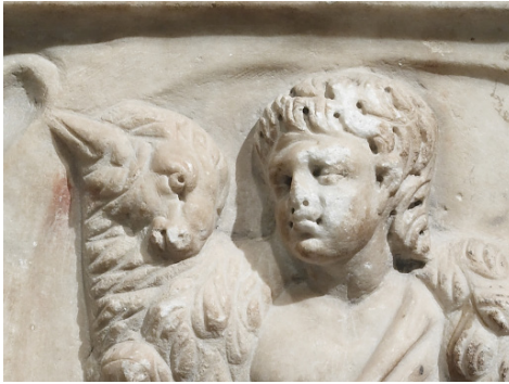
Sarcophagus Fragment with the Good Shepherd Roman (Artist) Early 4th century (Late Antique) Marble The Walters Art Museum, Baltimore

This fragment comes from a small Early Christian sarcophagus that was probably made for a child. At the right is a young shepherd, who carries a lamb over his shoulders as two sheep gaze up at him from below. The image of the Good Shepherd originated with the pagan Greek figure of Hermes (the gods' messenger and ram-bearer) and was later transformed into Jesus as the Good Shepherd who watches over his flock.