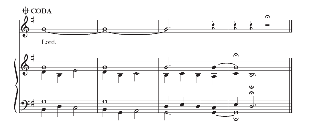
CelebrantAll things come of thee, O Lord;PeopleAnd of thine own have we given thee.