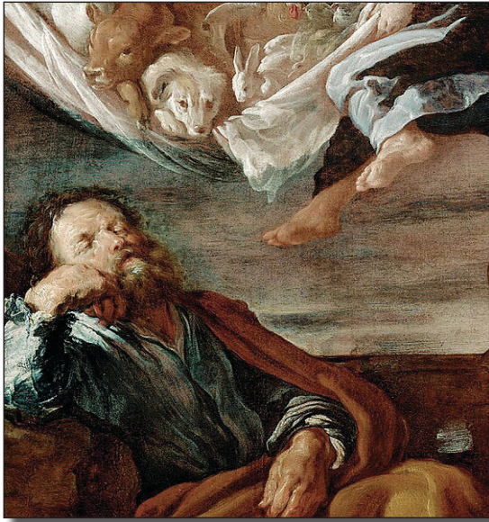
Peter's Vision of a Sheet with Animals Oil on Canvas, 1619