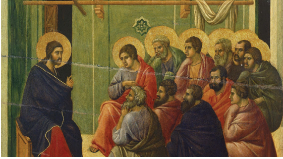
Christ Taking Leave of His Disciples Duccio di Buoninsegna (mid 13th century - 1319) Tempera and gold on Panel, Museo dell'Opera del Duomo, Siena (1308-1311)